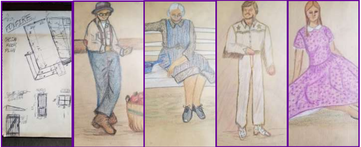
My sketch of the floorplan and the cabin details

unique working relationship. In addition to directing each other in both plays and musicals, we also had varied onstage relationships as stepmother/stepson in The Miracle Worker , love interests in Butterflies are Free , and husband/wife in the musical Company . We had also directed each other in previous productions. In addition to co-directing the play, we agreed that I would design the set and she would design the costumes.