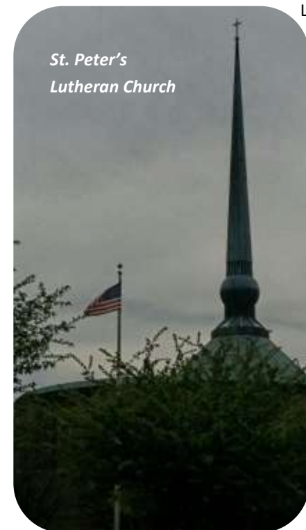
St. Peter's Lutheran Church

As fate would have it, a couple of years ago one of my sons-in-law changed jobs. As a result, he, my daughter, and granddaughter moved from Indianapolis to Bloomington! Would I have moved to Columbus almost six and a half years ago if both daughters had been living in Bloomington? Probably not. Am I still glad I moved to Columbus? Yes, I am.