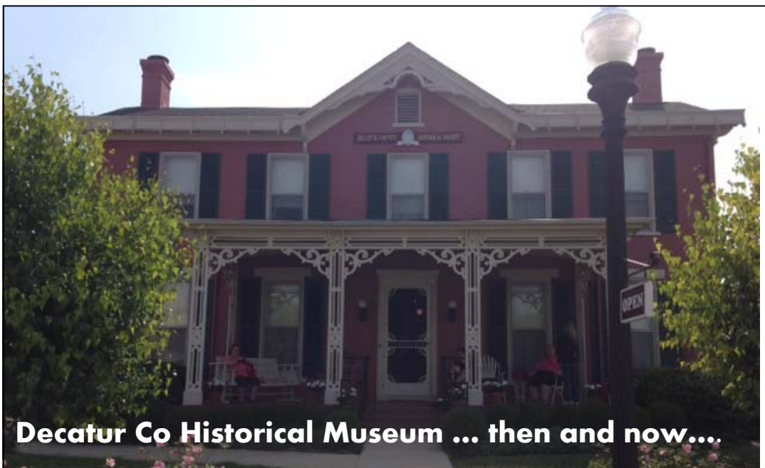
Decatur Co Historical Museum ... then and now...