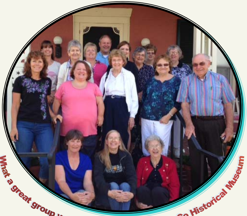
What a great group we had touring the Decatur Co Historical Museum

Saturday, Nov 22 1pm Red Room, Bartholomew Co Public Library